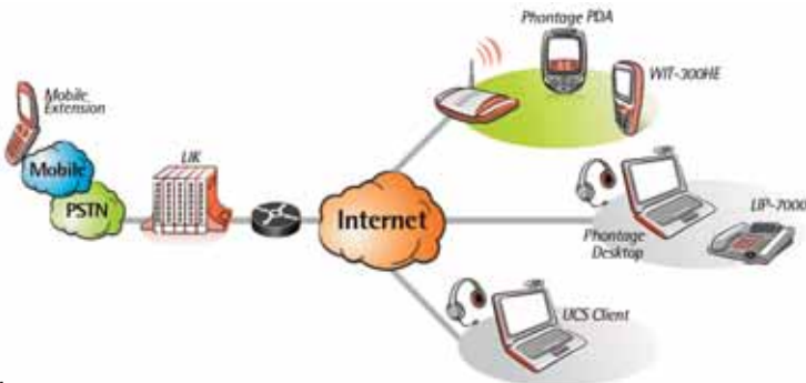
MOBILITY, A TOOL FOR THE COMPETITIVE EDGE

To discuss how our full service offering can advance your business success, simply call us on (03) 9325 6666 or visit www.1step.com.au